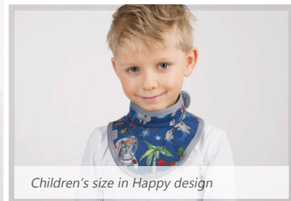
Children's size in Happy design