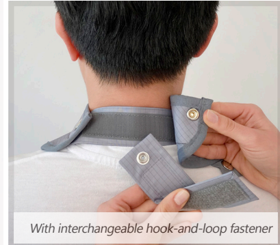
With interchangeable hook-and-loop fastener

Note: In order to meet hygiene requirements, we recommend that you use our washable hygienic cover made from special ComforTex® MF material "Titan" colour.